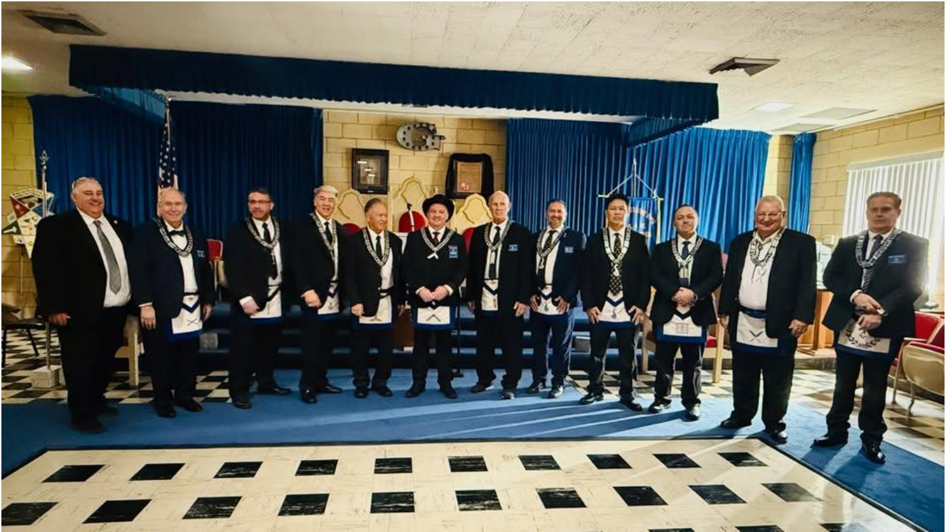
MLT and District School. I spy a DI