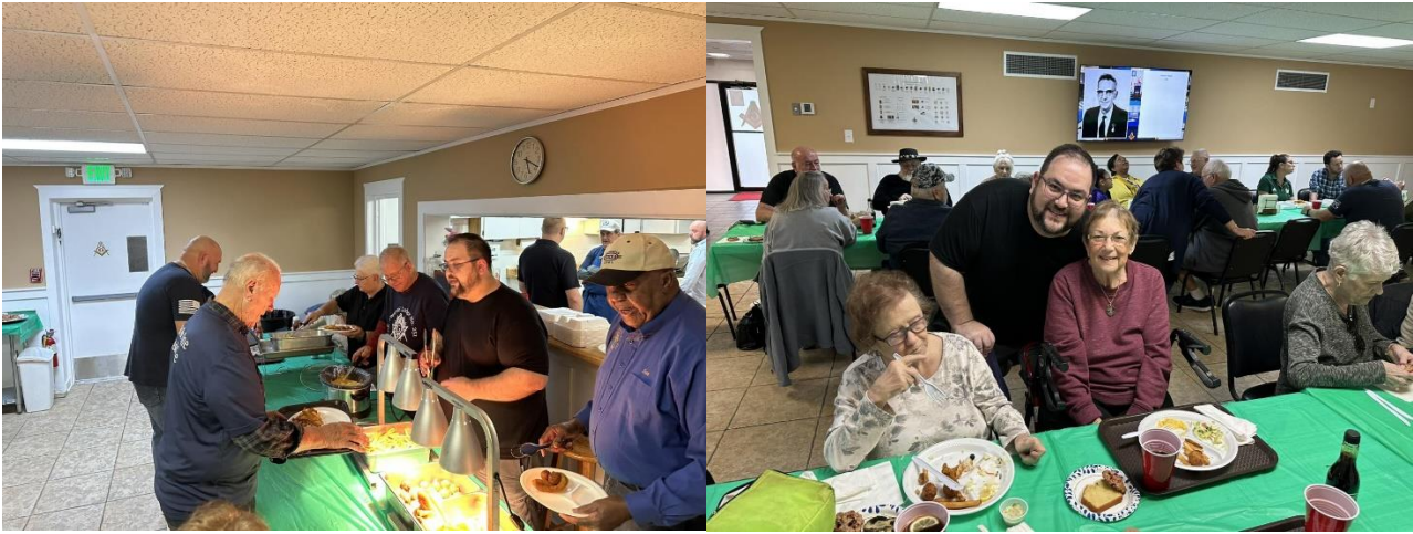
Another fun and informative night at the Master Mason Association meeting. Always a good time down at Egypt Temple. Thanks to all the Brothers from Swartsel who came out to support your Lodge!